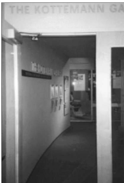
The Kottemann Gallery at UIC.