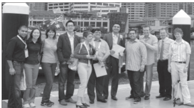
University of Manitoba attendees at WFO in Sydney