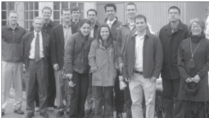
Attendees at the Eric J. Schweitzer Memorial Symposium

Each year UMKC Graduate Orthodontics organizes the Eric J. Schweitzer ('92) Memorial Symposium. The purpose of the symposium is to have recent orthodontic graduates make presentations to current orthodontic resi-