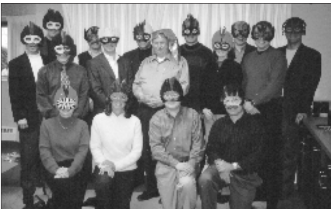
MSO Officers and Directors preparing for the first-ever joint meeting of three constituents to be held at the New Orleans Marriott, September 18-21, 2003 (see page 22).