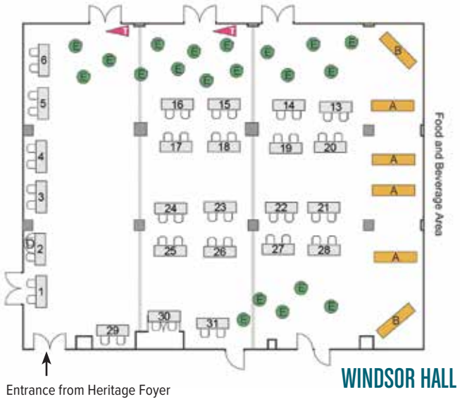
EXHIBIT HALL FLOOR PLAN