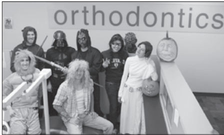
Orthodontic residents enjoy the festivities of Halloween.