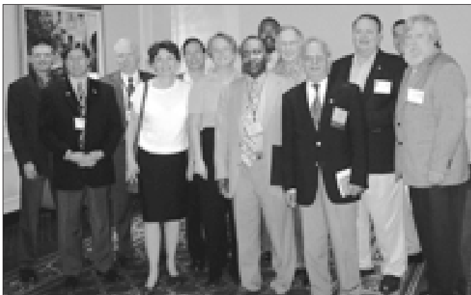
Academicians from orthodontic educational facilities located within the boundaries of the GLAO, SWSO and MSO met in New Orleans in September.

The GLAO/SWSO/MSO representatives to the Council on Orthodontic Education invited academic orthodontists from the three constituents at the combined meeting in New Orleans to a luncheon on September 20, 2003. The activities of COE were reviewed and discussed.