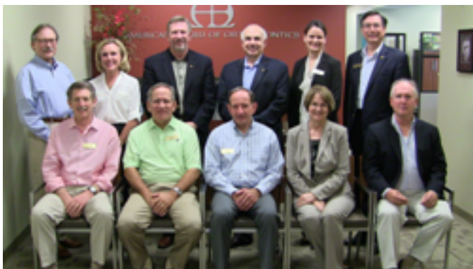
ABO Board at strategic planning